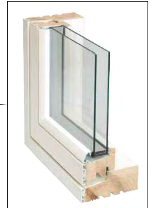
Rationelle Aldus windows and doors, external colour black, RAL 9005