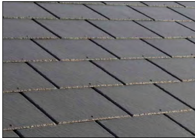
Marley Eternit Rivendale blue black slates