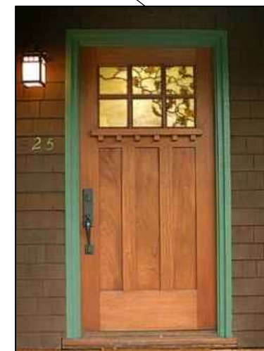
Stained hardwood 'arts and craft' front door and garage