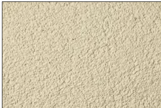
1.5mm aggregate white through-coat render